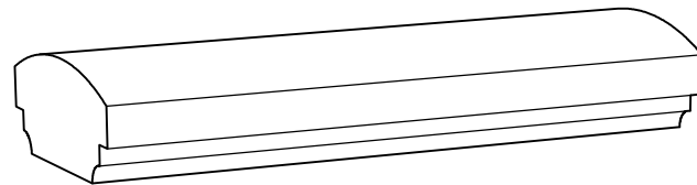
HR-324 Hand Rail Formerly HR323

Note: All Hand Rail Profiles shall be provided in 24" lengths, typical.