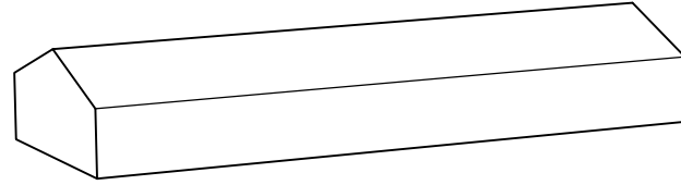
HR-321 Hand Rail Formerly HR320